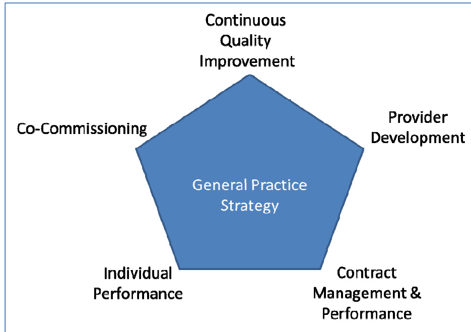
Figure Four: NHS Halton approach to co-commissioning

To support the development and implementation of this strategy, including successfully delegated co-commissioning status from NHS England, we have identified five key elements involved in the commissioning and contracting of General Practice: