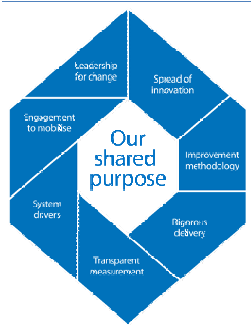
Figure Two: NHS Change Model

The underlying approach in developing the strategy has been based on the stages described within the NHS Change Model 5 .