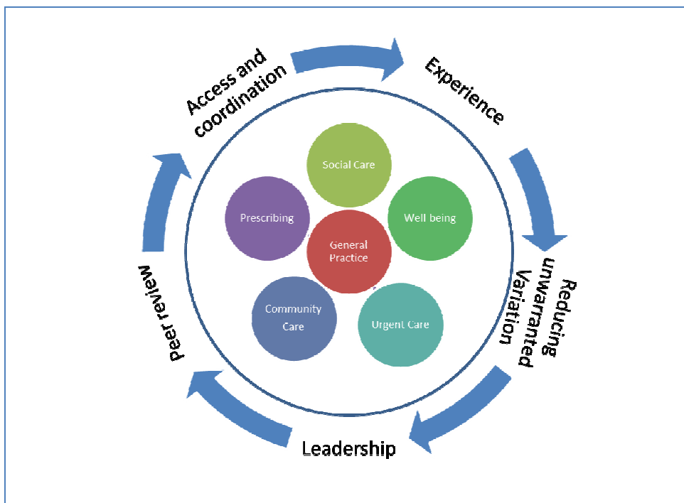
Figure Three: Integrated health and delivery model

Our future model of care will be established with services being centred around people in the community. Delivery may be across the whole CCG on a Halton-wide footprint; by bringing more than one GP practice together to service distinct communities through a 'hub' based approach; by sustaining individual practices wherever appropriate and by giving local people and communities more opportunities to self-care and create resilience. The constant in the model is to ensure that everyone's needs are met through an integrated health and care delivery model. Integration will involve practices working together with acute care, community and mental health providers as well as social care, the voluntary and community sector and a host of other organisations and individuals, as described in the diagram below.